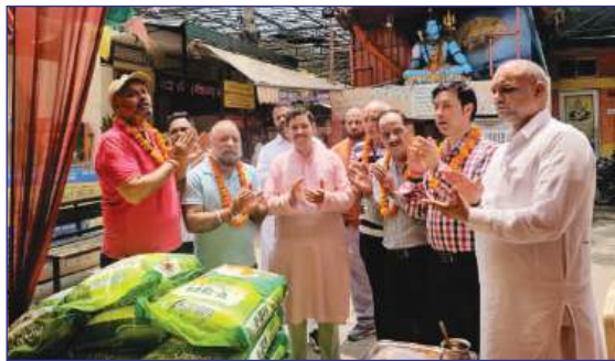
Donation made for the Langar for Amarnath Pilgrimage.