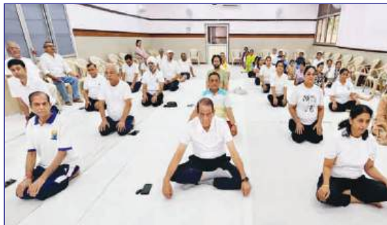
Celebration of Yoga Day at Sood Bhawan.