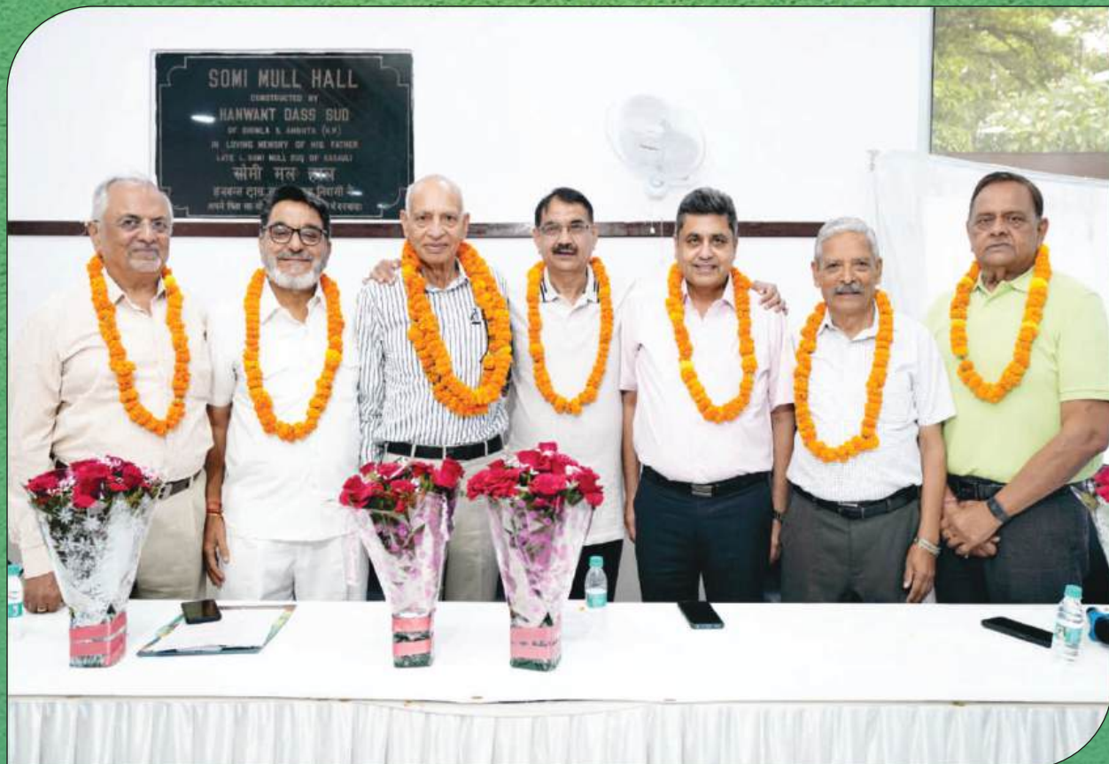
“Facilitation of the new office bearers”

• Sood Sandesh ₹ 500/- (Membership for ten years)