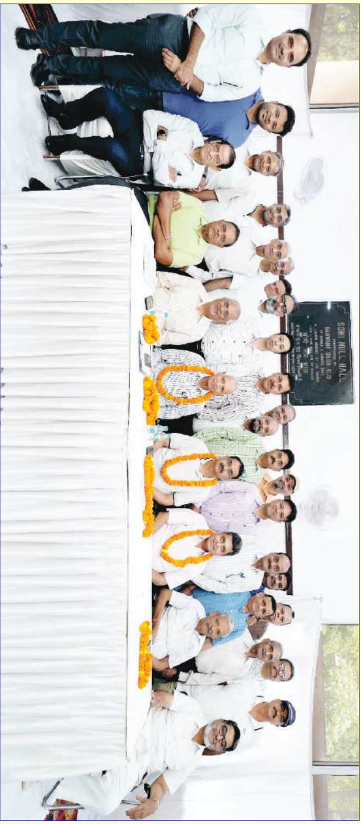
Sood Sabha, Chandigarh Executive Committee - 2025-2027